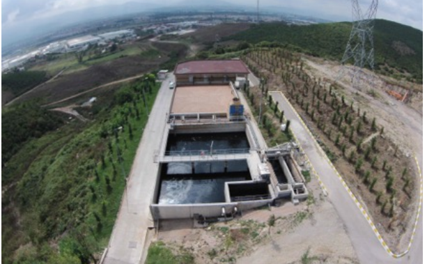
Pic.9: IZAYDAŞ Wastewater Treatment Plant