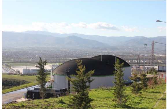
Pic.8: IZAYDAŞ Biogas Plant