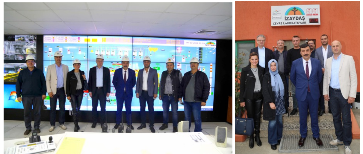
Pic.6 & 7: Inside IZAYDAŞ Operator Control Room

Facilities and plants operated by IZAYDAŞ include a clinical and hazardous waste incineration and power generation facility, sanitary landfills, waste transportation services, LFG, methane gas power plant, interim waste storage facility, an IZAYDAŞ laboratory, waste reception vessels, sea surface vacuum cleaners and marine control and protection aircraft, medical waste sterilization facility, landfill leachate treatment and recycling facility, biogas integrated power generation facility and Yuvacık Dam channel type Hydroelectric Power Plant (HEPP).