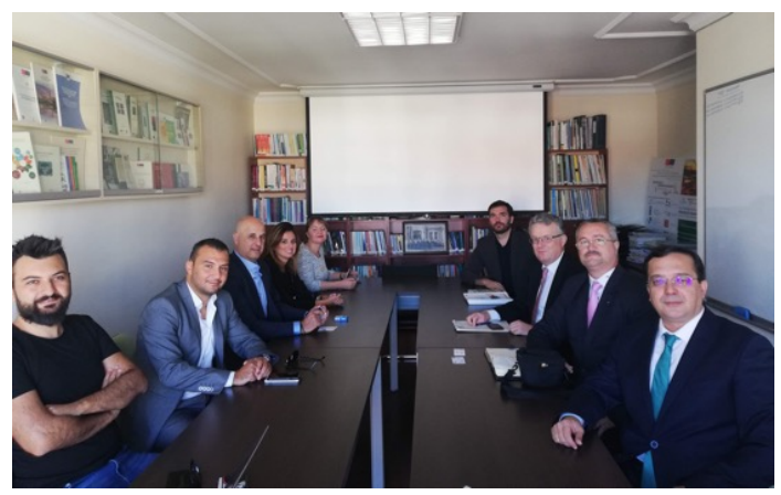
Pic.1: Meeting with REC Turkey/Bölgesel Çevre M.

The general lack of funds for waste treatment plants and other environmental projects leads to a search for alternative funding methods, such as PPP (Private Public Partnership) and BOT (Build Operate Transfer).