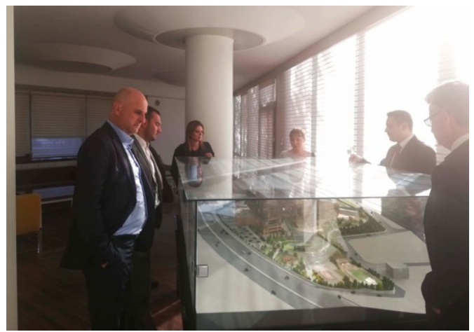
Pic.4: Visit at the Ministry of Environment and Urbanisation, Ankara

Energy supply and the preservation of environment are further political focus points. Around 8 billion euros are being invested to find alternative solutions for energy production (solar, wind, hydropower), as well as to create new parks, 3000km quite walkways and 3000km new cycle paths. Hence, the closed Atatürk Airport in Istanbul will be rebuilt into a park.