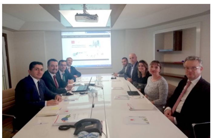
Pic.2: Meeting with Union of Municipalities of Turkey

Here lies an opportunity for European and foreign companies to present their technical solutions in the range of waste logistics and recycling plants.