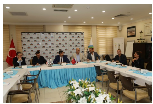
On the second day of the explorative journey, a visit of the country's largest hazardous waste incinerator facility in the richest Turkish province Kocaeli, Izmit was organized. All the country's hazardous waste is being disposed in Kocaeli and processed by IZAYDAŞ.

IZAYDAŞ was established by the Metropolitan Municipality in 1996.