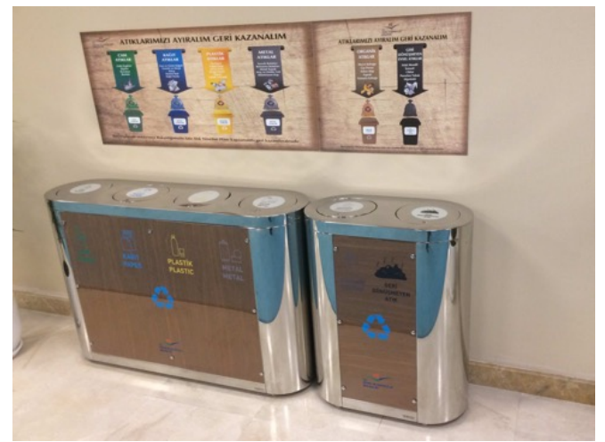
Pic.3: Separation container at the Ministry, Ankara

In 2017, First Lady Emine Erdoğan launched a Zero Waste Project aiming to promote recycling. The Prime Ministry and Parliament have already included various collection points for separate waste collection. Various schools and restaurants across the country are joining the campaign.