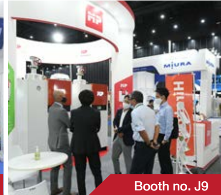
Booth no. J9