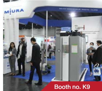
Booth no. K9