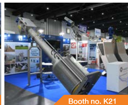
Booth no. K21