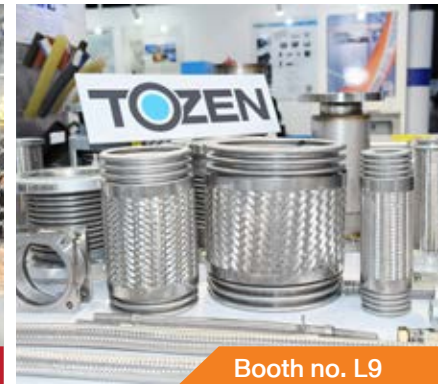
Booth no. L9