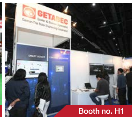
Booth no. H1