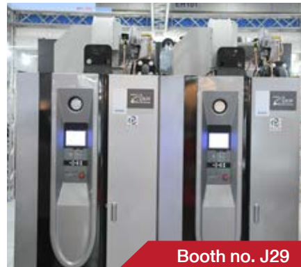
Booth no. J29