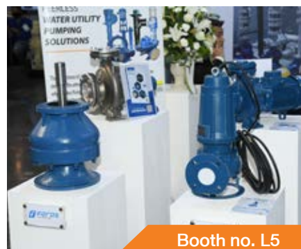
Booth no. L5